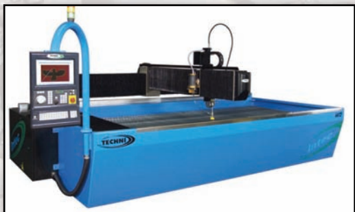
Pictured here is the waterjet machine used to create the pieces we produce.

Another option we offer is any metal sign we create can be powdercoated (painted).